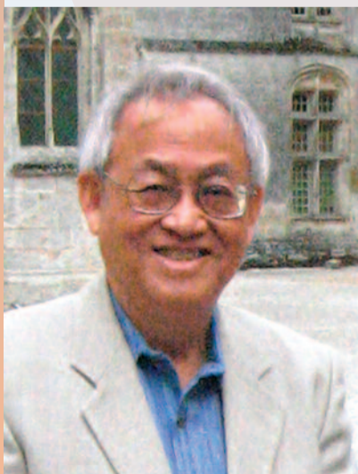
Prof. Leon O. Chua

Participants of 11 th ECNDT 2014 have entrance free.